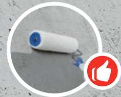
Sealer for concrete*