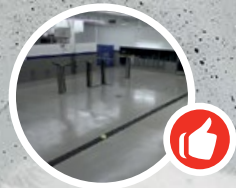
Matt or gloss finish for pre-painted surfaces

* not suitable for direct use on power floated concrete